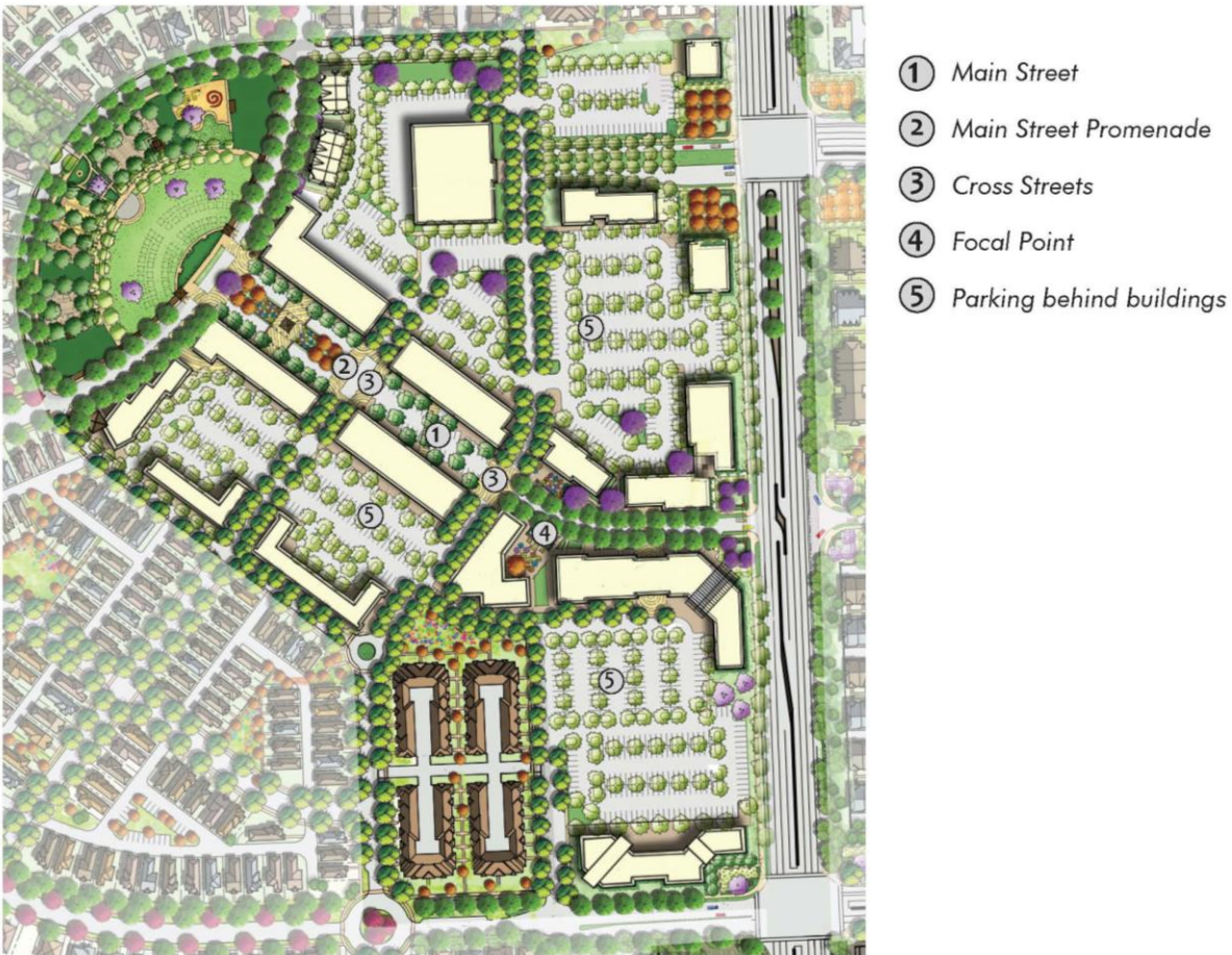
Figure A.2: Village District Urban Form

A goal of the ARSP is to create a focal point visible from Westbrook Boulevard, to draw passersby into the Main Street. This may be accomplished by creating a small plaza for social gatherings/events. As a focal point, some sort of vertical element is required. This requirement may be fulfilled by a sculpture, fountain, specimen tree, architectural tower, or any number of other vertical elements. Shared parking areas occur behind the Main Street buildings and do not front directly on the Main Street.